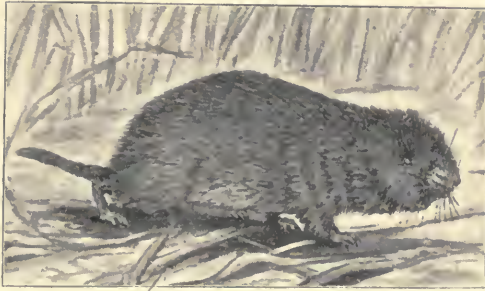
FIG. XXXV. MICROTUS C. HYPERYTHRUS . REDDISH MEADOW VOLE.